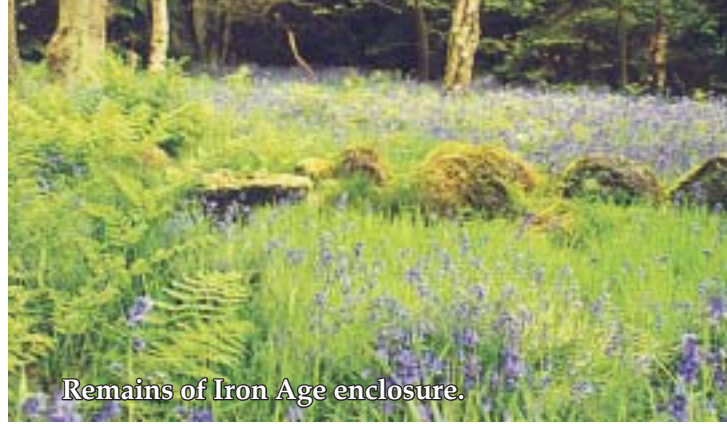
Remains of Iron Age enclosure.

More recently there were several small quarries on the hillside above Summerbridge, the stone most likely used to build new enclosures in the second half of the 19th C.