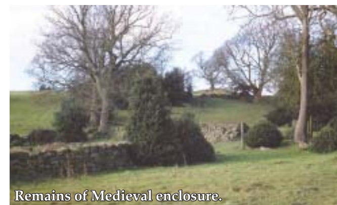
Remains of Medieval enclosure.

In 1132 the Cistercians were granted land to build Fountains Abbey a few miles from here and in 1135 Lord Mowbray granted them lands in Nidderdale, including Hartwith. Fountains Estate was initially farmed "in house" by Lay Brothers, and an expansion of husbandry and woodland management was encouraged. Lodges (farms) and Granges (somewhat larger administrative centres with farms) were established. They often specialised in cattle and sheep rearing and even fish farming using water from the Lurk Beck. By the 14 th C., much of the estate had been leased out to tenant farmers, though the woods were retained by the Monks. Brimham Lodge and the Park remained under the control of the Abbot.