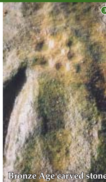
Bronze Age carved stone

Remains of a very early settlement can be seen in Old Spring Wood. It is believed that they date from Iron Age times, 600BC-70AD. Quern-stones of a beehive shape formed from the local sandstone have also been found in the area.