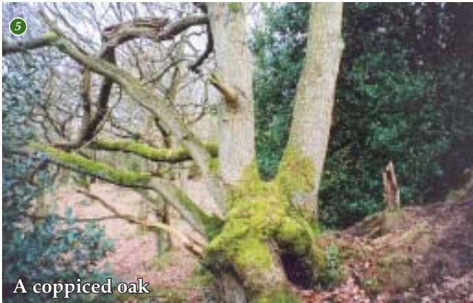
A coppiced oak

After the Dissolution of Fountains Abbey more of the woodland was cleared to create fields for agriculture.